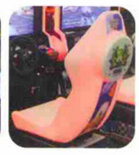
Ticket payout [available as an optional kit] Sonic & SEGA All-Stars Racing ARCADE features a ticket option, which will reward players who win the race with a ticket payout. An optional multiplier can also be activated so when playing a multiplayer race this ticket payout is multiplied by the number of players competing.